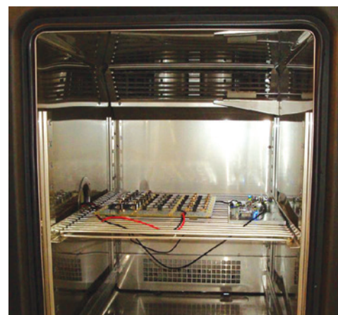
Figure 1. SmartMesh Nodes Operating in a Temperature Chamber

The test bed has a dense, noisy RF environment because each network under test is immersed in a sea of wireless traffic from the other networks operating simultaneously. This network traffic, along with nearby Wi-Fi routers, Bluetooth and cellular radios, create an elevated RF noise floor representative of an extremely challenging RF environment.