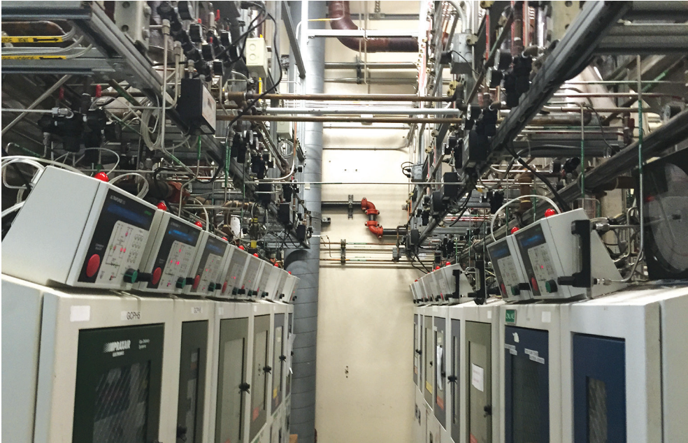
Figure 4. Dense Metal and Concrete—Wireless Nodes Must Perform Reliably Even When Located Among Metal Equipment and Gas Distribution Pipes

Wireless sensor networks used for Industrial Internet of Things applications must meet the highest bar for reliability over a long service life. In order to assure that networks meet these stringent requirements, system hardware and software must be designed from the ground up for industrial performance, tested at the component, interface and network level with rigor, and in-service