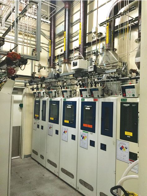
Figure 3. Toxic Gas Cabinets at Linear Technology's Wafer Fab are Closely Monitored to Ensure Uptime