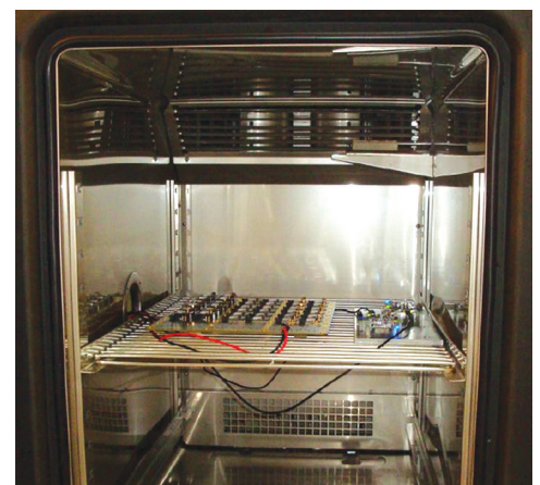
Figure 1. SmartMesh Nodes Operating in a Temperature Chamber

The test bed has a dense, noisy RF environment because each network under test is immersed in a sea of wireless traffic from the other networks operating simultaneously. This network traffic, along with nearby Wi-Fi routers, Bluetooth and cellular radios, create an elevated RF noise floor representative of an extremely challenging RF environment.