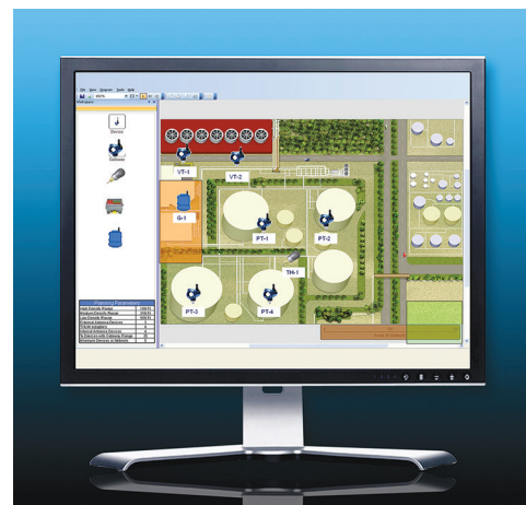
Figure 2. Network Visibility—Network Management Software Provides Critical Visibility to the Health of the Wireless Network Such as in This SNAP-ON Software Utility from Emerson Process Management

Also, systems should be available for global deployment, since the widespread adoption of Industrial IoT by end users is often company