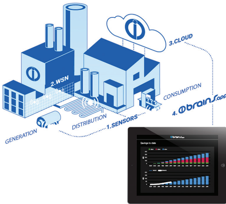
Figure 3. Driving Change—Software Analytics, Such as the Brains.App Software from IntelliSense.io, Use the Data from Industrial Wireless Sensor Networks to Streamline Plant Operations, Optimize Yield and Improve Safety

The Internet of Things is very much an industrial phenomenon, with clear business drivers and compelling ROI. In these business-critical applications, industrial wireless sensor networks must meet a high bar for smarts, security and reliable wire-free operation over many years. These stringent requirements can be met with existing and emerging wireless mesh networks standards, which will be key Industrial IoT building blocks to help industrial customers transform their businesses and services in the Industrial IoT era (see Figure 3).