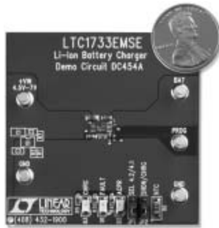
Figure 2. Full featured single cell Li-ion charger

If the BAT pin voltage is below 2.48V at the beginning of a charge cycle then the charge current will be one-tenth of the programmed value in order to safely bring the cell voltage high enough to allow full charge current. If the cell is damaged, and the voltage does not rise above 2.48V