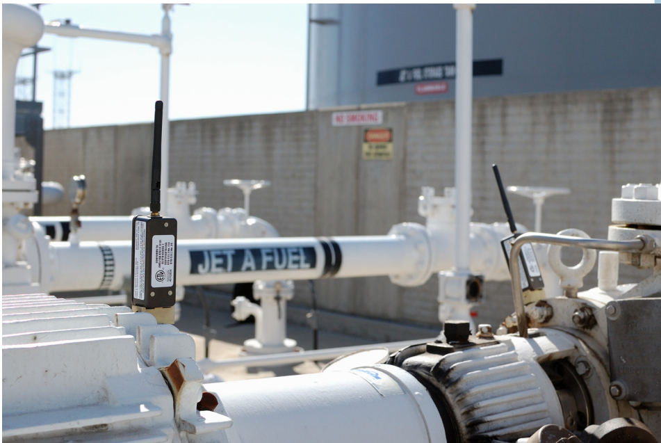
FIGURE 3. Condition monitoring in hazardous environments, SmartHAWK Wireless Vibration & Temperature Sensors from TDG Technologies monitor pump vibration and temperature at an airport fuel tank farm.